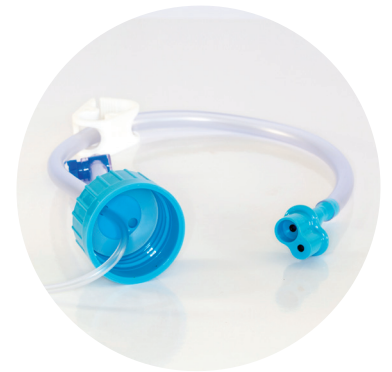
Olympus 180/190 CleverCap

Tested for and by Australian health care facilities to ensure reliable performance