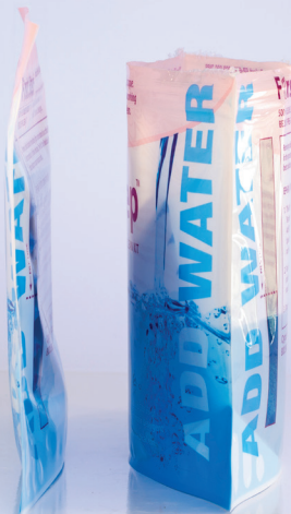
Before Water Water Added

Simple2 effectively dissolves blood, fat, tissue, protein and most other forms of organic material. Simple2 is low-foaming, non-toxic, non-corrosive, latex-free, neutral pH and safe to use on all flexible endoscopes.