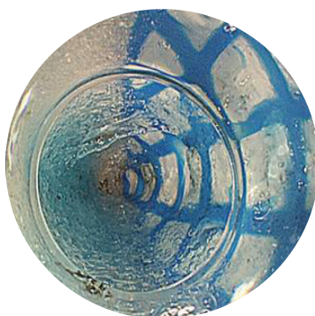
Forming a tunnel (POEM)