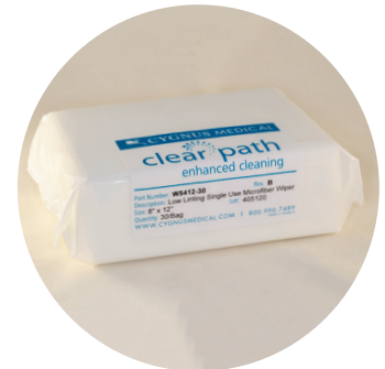
Convenient waterproof dispenser package